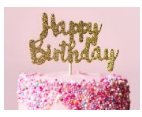
Beverly Baker - 2/5 Anna Voss - 2/14