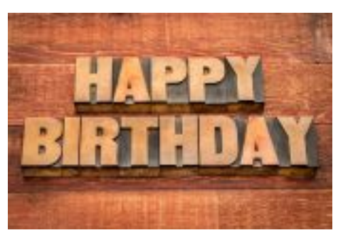
Tanisha Barnes - 2/10